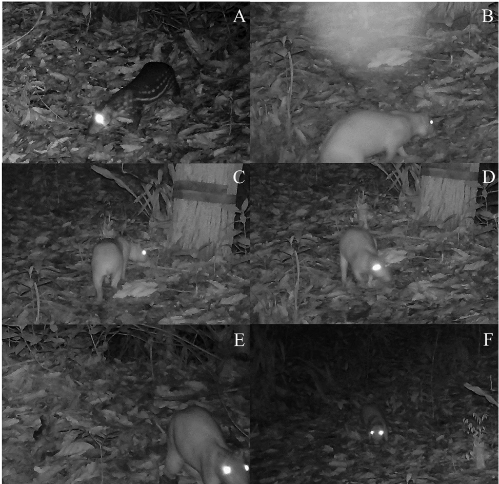
Figure 2. Photographs of a paca ( Cuniculus paca ) with normal colouration (A) and an albino individual in a medium subdeciduous forest in the Sierra Norte of Oaxaca, Mexico (B–F).