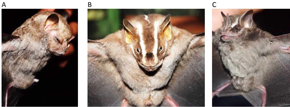
Fig. 3. (A) Salvin's Big-eyed Bat ( Chiroderma salvini ), (B) Heller's Broad-nosed Bat ( Platyrrhinus helleri ) and (C) Thomas's Fruit-eating Bat ( Artibeus watsoni ).